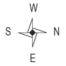
BENTON HALL - 1st Floor