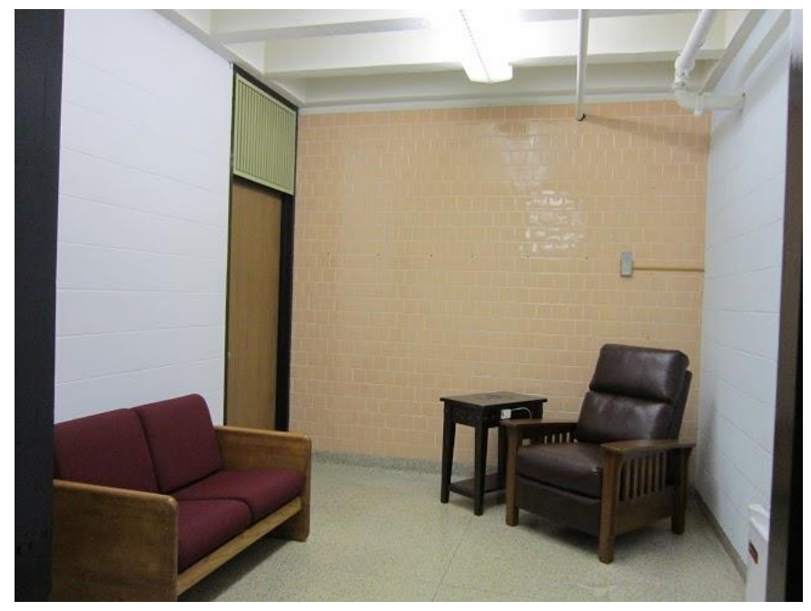
** A security button is located beneath the table in the lactation room for your safety. Pressing the button immediately alerts campus Public Safety of your location. **