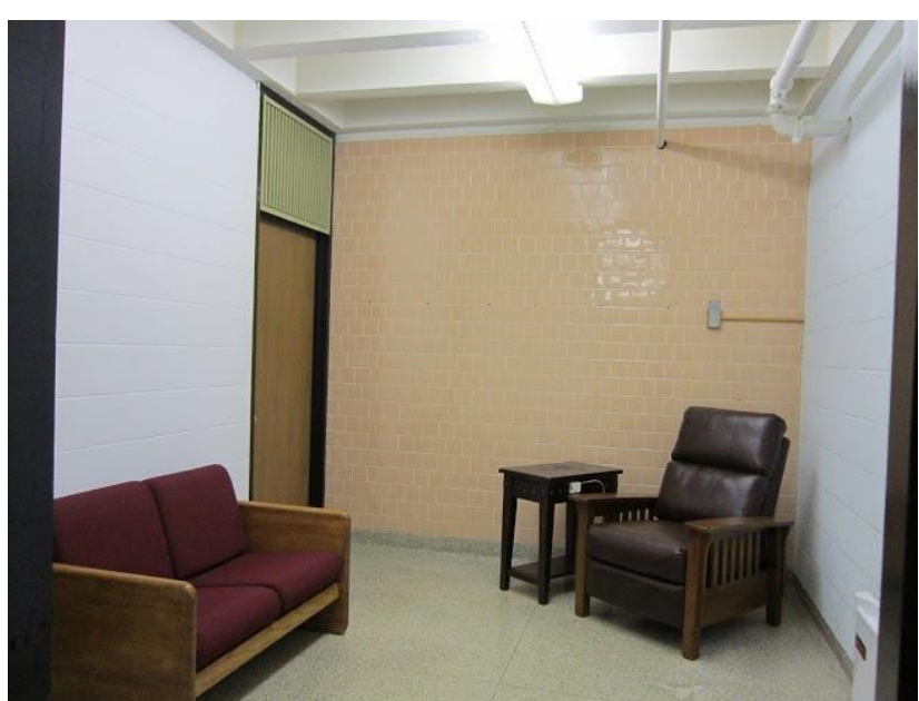
** A security button is located beneath the table in the lactation room for your safety. Pressing the button immediately alerts campus Public Safety of your location. **

For comments or suggestions regarding this or a similar document, please contact the Office of Equity and Affirmative Action, AS 102: (320) 308-5123 or affirmative action@stcloudstate.edu.