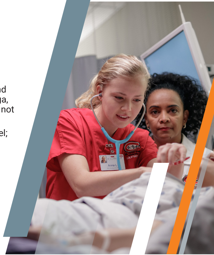
Example: Dress Code for Clinical Settings