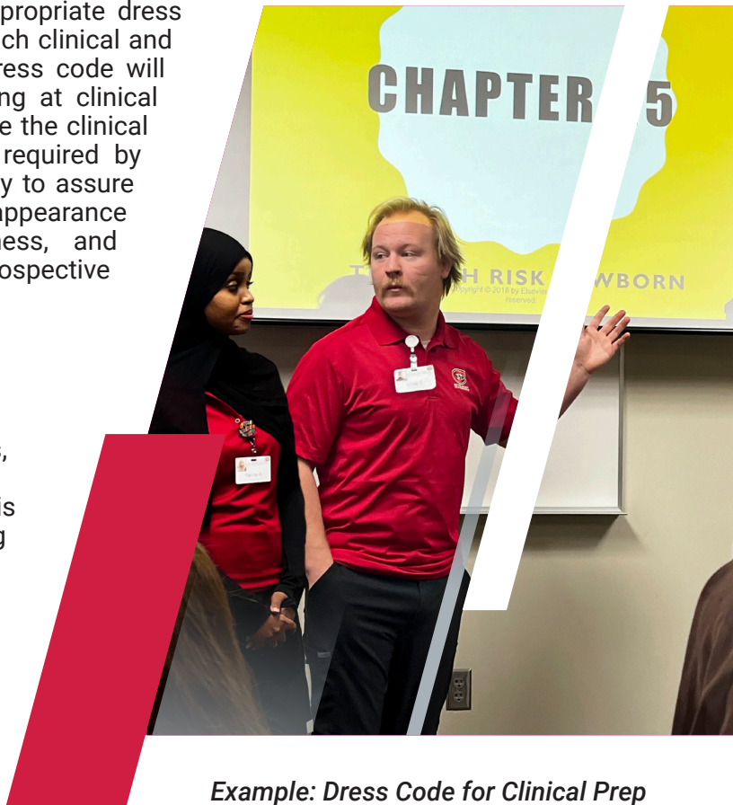
Example: Dress Code for Clinical Prep