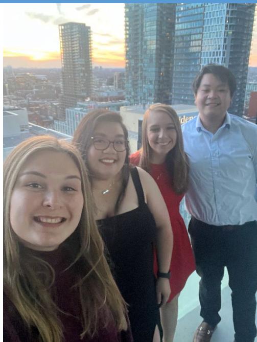
2017 Association for Specialists in Group Work Conference (top) and American Counseling Association (bottom left) and Minnesota Counseling Association (bottom right)

The CMHC program is established to prepare graduates to enter the profession of a Licensed Clinical Mental Health Counselor. The term profession in this context means an occupation or career for which there is a known body of knowledge, both theoretical and research based, and to which there are an identified set of appropriate skills, and a set of behavioral standards adhered to by members of the profession.