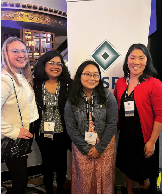
Conferencing is a great way for CCSD alumni, students, and faculty to connect. Go Huskies!

From November 6-8, 2022, several CCSD students, faculty, and alumni made their way to the "Windy City" for "WEnvision Our Future" the NASPA IV-West/East Joint Regional Conference in Chicago, IL. Here are some highlights from our time together at the conference.