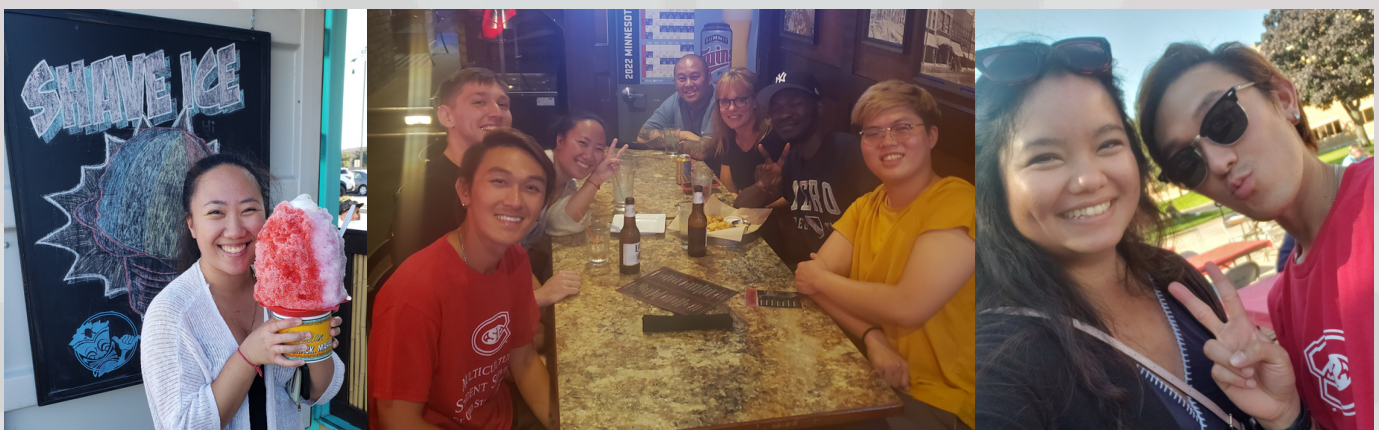
Photos from CCSD Student Organization programming in fall 2022.