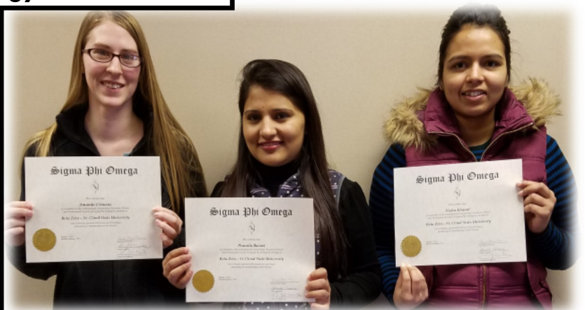
Congratulations to the new SPO Members!