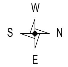
CENTENNIAL HALL - 2nd Floor