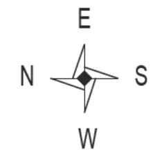
WHITNEY HOUSE - 1st Floor