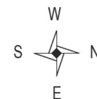
Richard Green House - Basement Floor