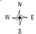
MILLER CENTER - 1st Floor