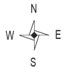
ISELF - 3rd Floor