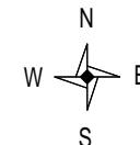
ATWOOD MEMORIAL CENTER - Lower Level