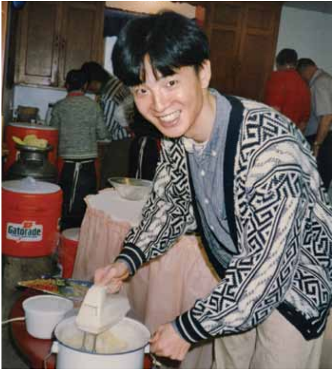
Guests are treated as "one of the family" sharing in cooking duties for the meal.