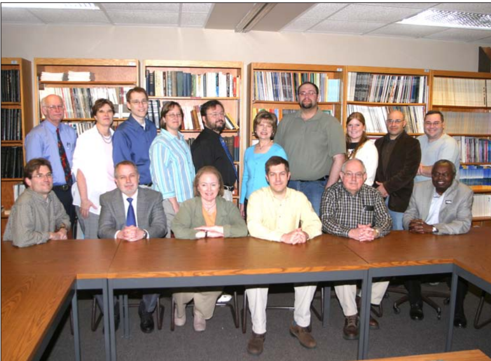
Some of the faculty and staff of the History Department.