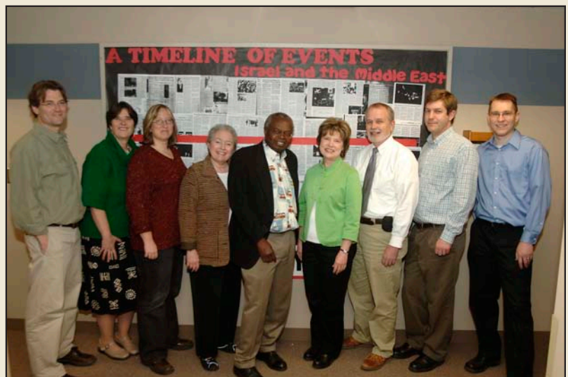
Some of the faculty and staff of the History Department