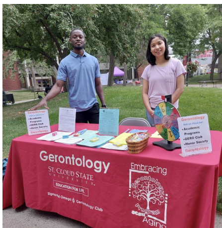
"Main Street at SCSU" Fall, 2023