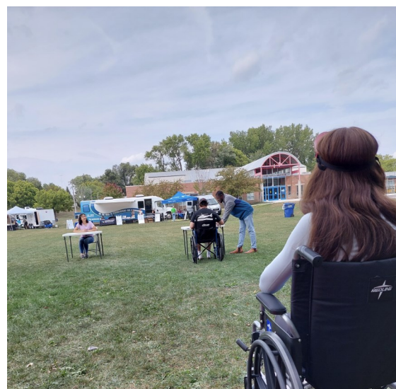
"Equity in Health Festival" Fall, 2023