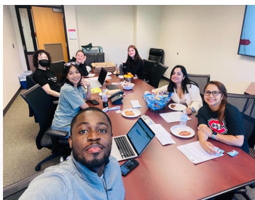
"Gerontology Club Meeting" Fall, 2023