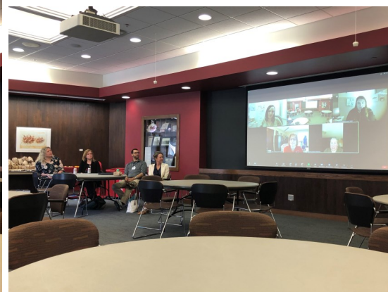
"Careers in Aging Presentation and Alumni Event" Spring, 2023