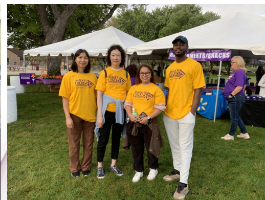
"Walk to End Alzheimer's" Fall, 2023

Thank you to all of our community partners for your ongoing support and hosting student interns and service-learners!