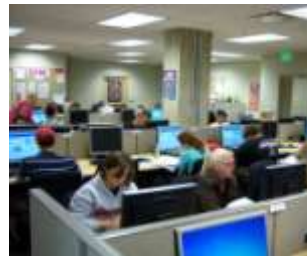
The Math Skills Center