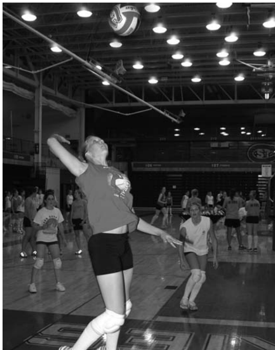
SCSU is an affirmative action/equal opportunity educator and employer.

Upon request this publication will be made available in an alternative format such as large print or audio tape. TTY: 1-800-627-3529