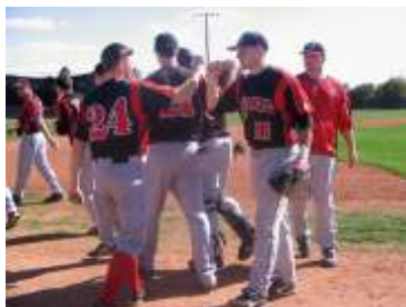
Learn from the best at the Starz of Tomorrow Baseball Academy

The team's success was also reflected in the classroom as the Huskies saw 19 student-athletes gain 3.00-or higher grade point averages in 2009.