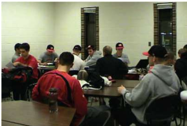
Several of the SCSU baseball players studying during the 2009 season.