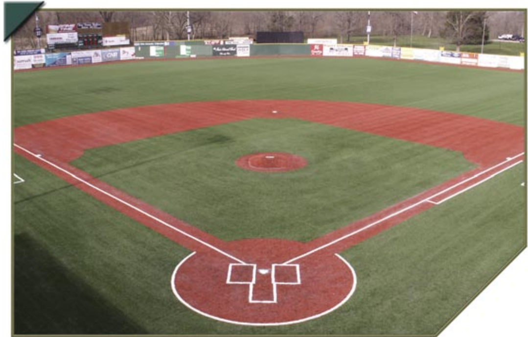
VA Memorial Stadium, Chillicothe, Ohio