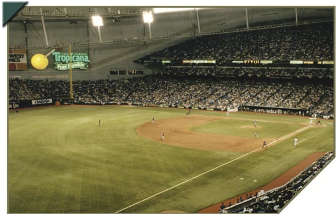
Tropicana Field, Tampa Bay

"We've played on FieldTurf for three years (at either Washington or WSU) and I don't think we've had an infielder make an error."