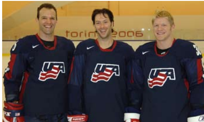
HUSKIES AT THE OLYMPICS: Three former SCSU players were on Team USA at the 2006 Winter Olympics in Torino. Those players include (l-r) defender Bret Hedican (1988-91), forward Matt Cullen (1995-97) and forward Mark Parrish (1995-97).

March 18, 2006 - WCHA Final Five Xcel Energy Center - St. Paul, MN St. Cloud State (22-16-4) vs. North Dakota (27-15-1) Attendance: 19,282 Total time: 2:28 SCSU 1 1 1 - 3 UND 3 2 0 - 5