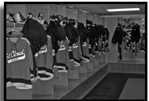
The NHC features a first-class locker facility for the Husky players and coaches.

In fact, SCSU owns a 229-122-36 all-time record in the National Hockey Center since 1989-90 — which translates to a .688 winning rate in the NHC. Over the last nine seasons, the Huskies own a 120-56-15 home ice record at the National Hockey Center.