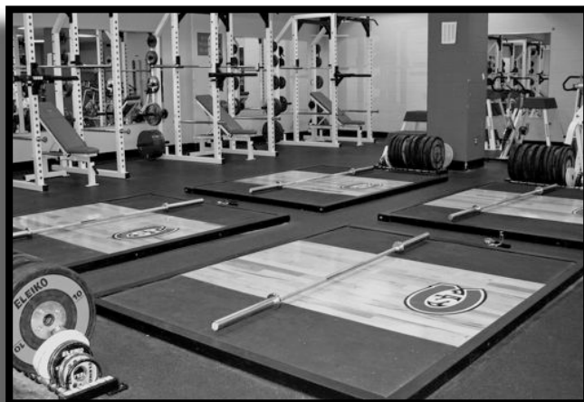
NHC weight training facility (above) and Athletic Training Room