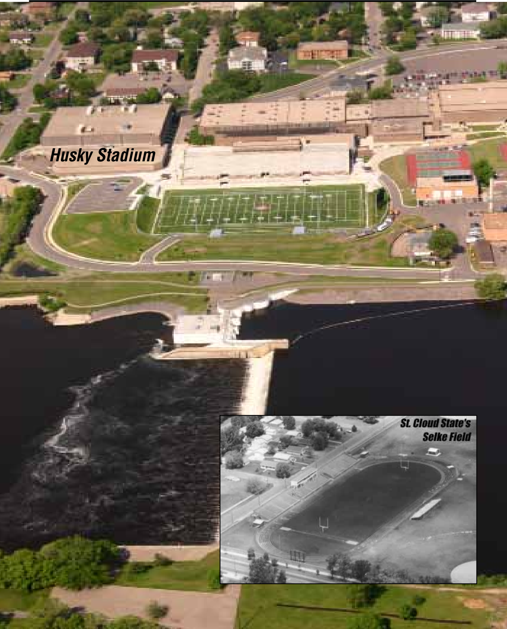
St. Cloud State's Selke Field