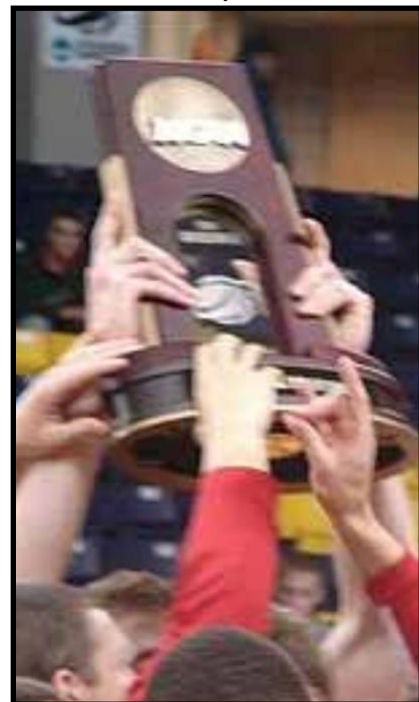
The Huskies celebrate a Regional Championship win over Augustana.