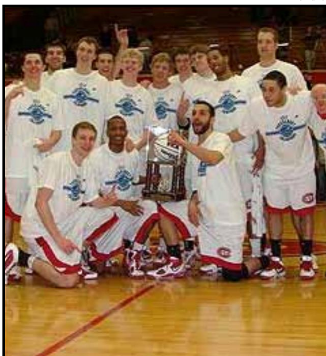
The Huskies celebrate a second NSIC/Sanford Health Tournament Championship