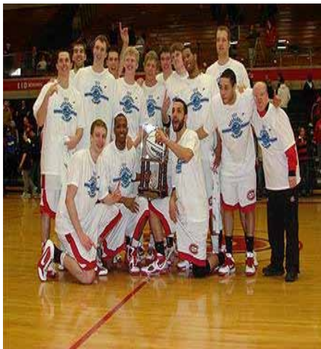
The Huskies celebrate a second NSIC/Sanford Health Tournament Championship