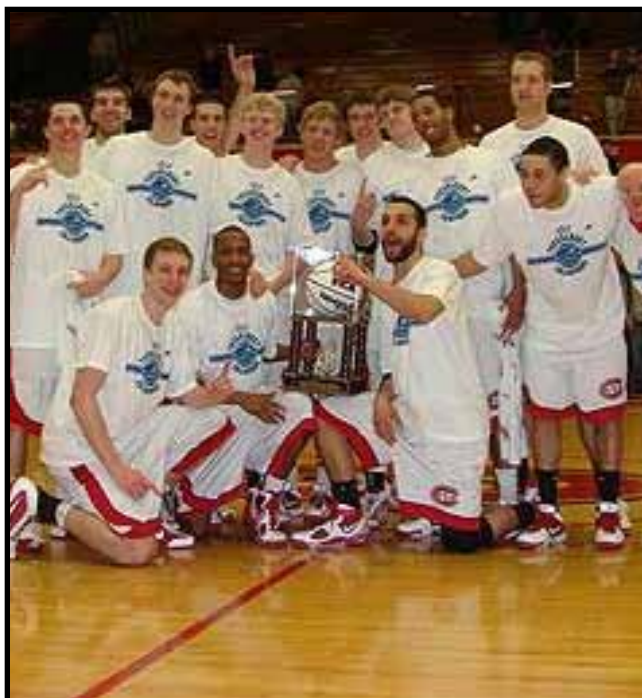
The Huskies celebrate a second NSIC/Sanford Health Tournament Championship