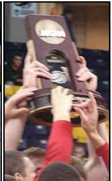
The Huskies celebrate a Regional Championship win over Augustana